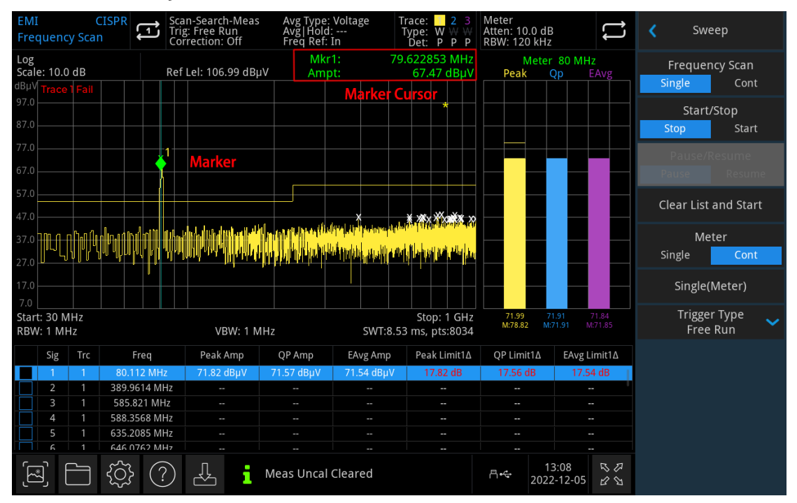
Figure 3-1 Reading of Marker Cursor

Press [Marker] key to access marker menu to select type and amount of marker. Marker is a rhombic icon, as shown in the Figure 3-1