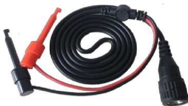
BNC to test hook connector