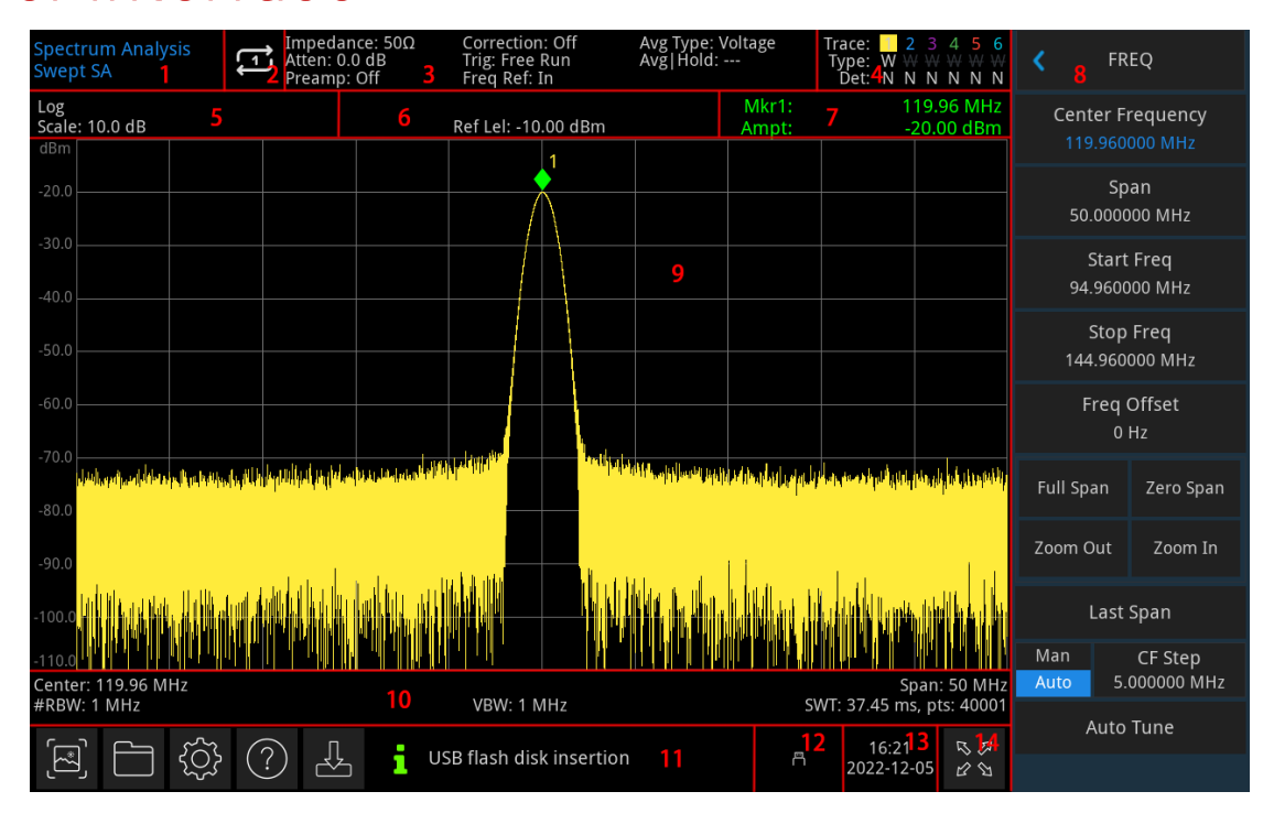
Figure 1-2 User Interface